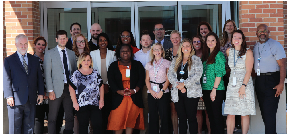
Wellness Center Care Team poses with Cerner representatives at our Aug. 28 ribbon cutting ceremony.